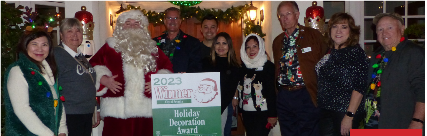
Members of the Arcadia Beautiful Commission and Santa Squad pose for a photo after presenting a 2023 Holiday Decoration Award Winner yard sign and certificate of distinction.